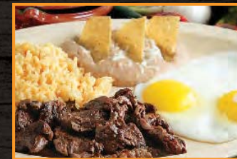
HUEVOS CON BISTEC