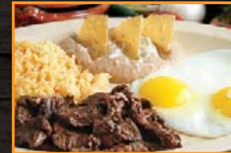
HUEVOS CON BISTEC