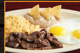
HUEVOS CON BISTEC