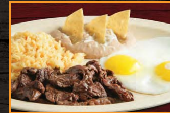
HUEVOS CON BISTEC