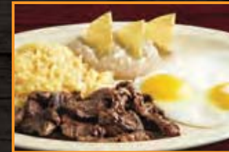
HUEVOS CON BISTEC