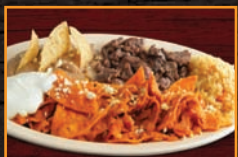
CHILAQUILES CON CARNE

Camarones | Carne Asada con Camarones Shrimp Fajitas