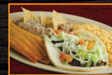
TACO & TAMALES

Three Flauta Combo ..... $7.99 Baby Burrito Combo ..... $7.99 Two Items Combo ..... $7.99 ( Enchilada | Taco | Tamale | Quesadilla )