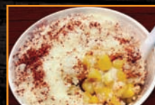
ELOTE (MEXICAN CORN)