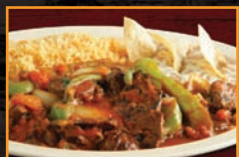
BISTEC A LA MEXICANA