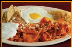
CHILAQUILES CON HUEVOS

Huevos Rancheros | Huevos a la Mexicana Huevos con Chorizo | Chilaquiles con Huevo Huevos con Bistec ..... $9.99 Chilaquiles con Bistec ..... $10.99