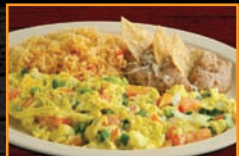
HUEVOS A LA MEXICANA