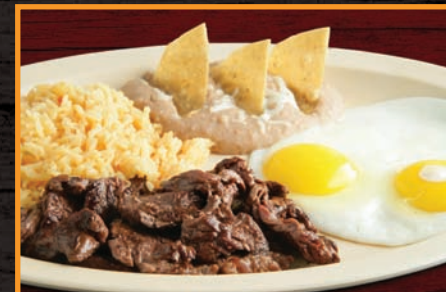
HUEVOS CON BISTEC