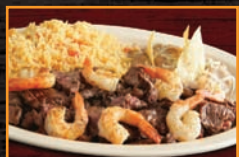
CARNE ASADA CON CAMARONES