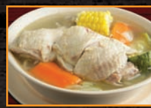
CALDO DE POLLO